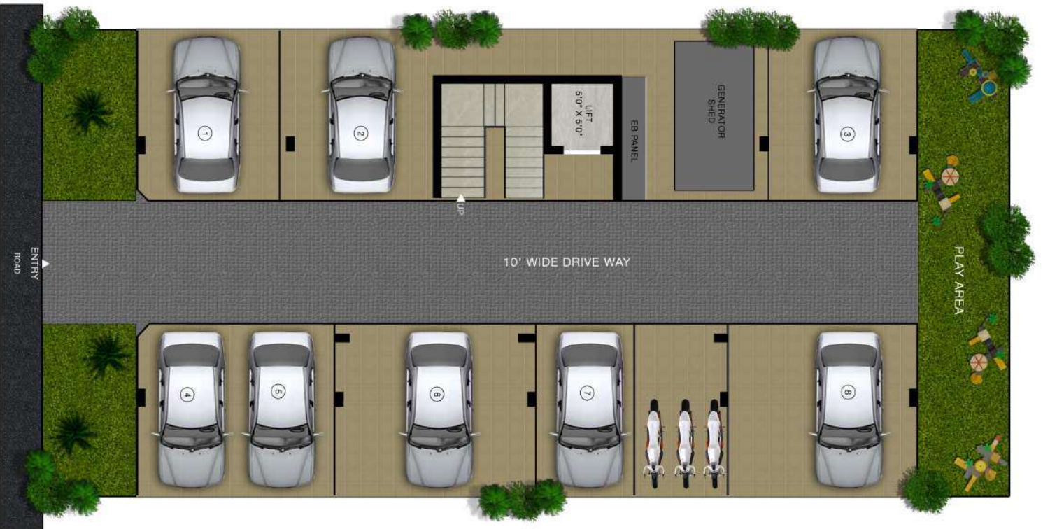
STILT FLOOR PLAN