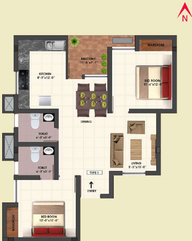
TYPE 1 (981 Sq.Ft.)