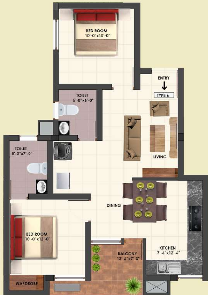
TYPE 6 (915 Sq.Ft.)