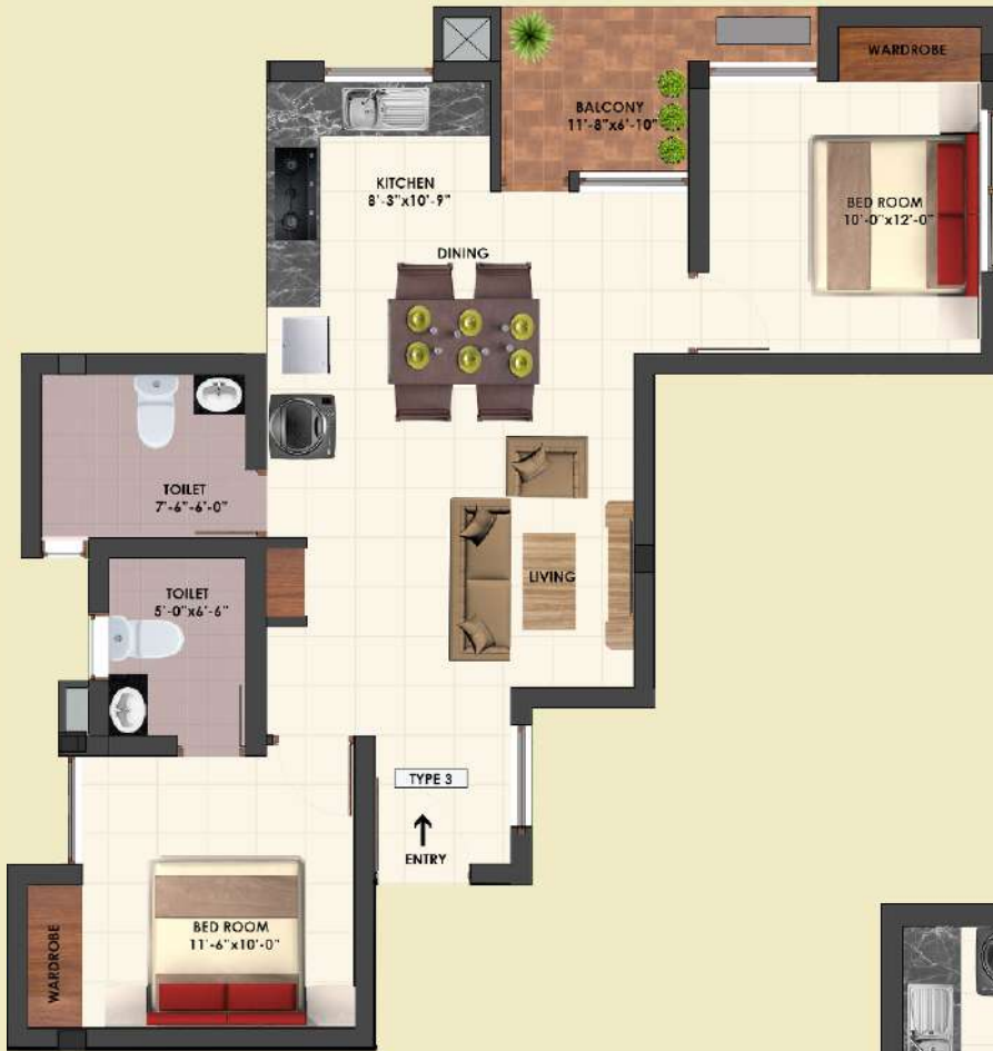
TYPE 3 (960 Sq.Ft.)