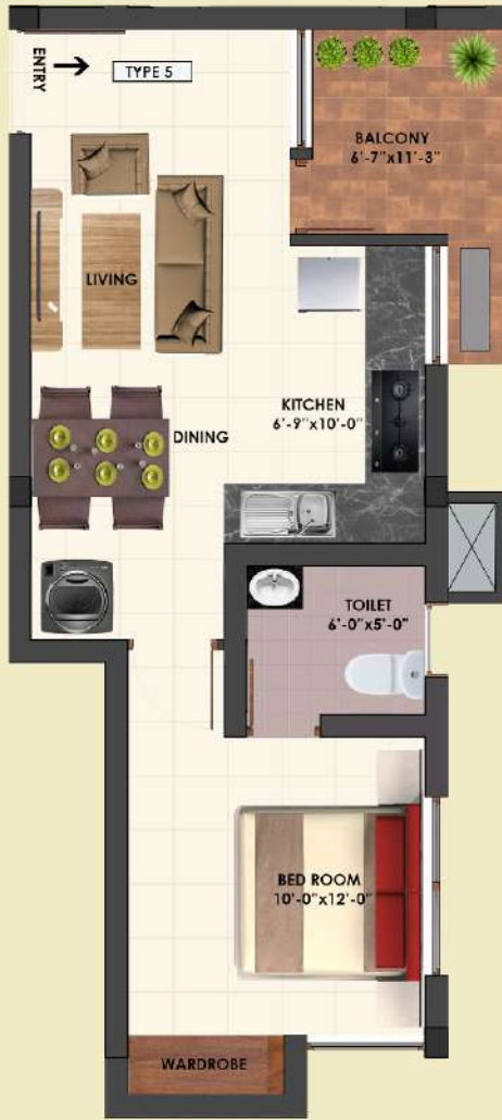
TYPE 5 (610 Sq.Ft.)