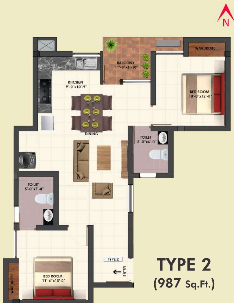
TYPE 2 (987 Sq.Ft.)