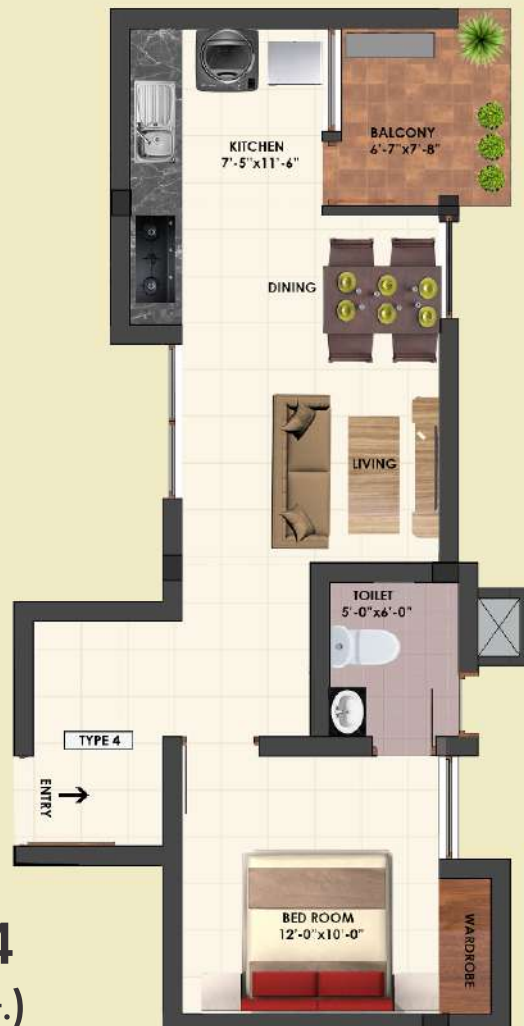
TYPE 4 (698 Sq.Ft.)